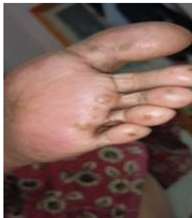
FIGURE 5: AFTER TREATMENT