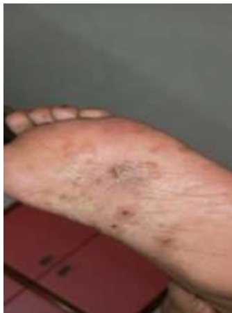
FIGURE 4: AFTER TREATMENT