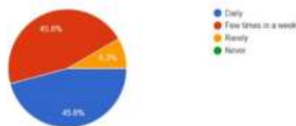
How often do you use digital communication platforms (social media, texting, emails, etc??)