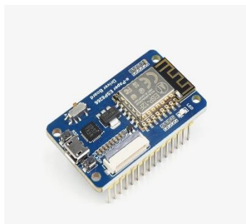
Fig no. 2

ESP8266: ESP8266 is a versatile Wi-Fi module that is commonly used in Internet of Things (IOT) projects. It has 128 KB RAM and 4 MB flash memory, which provides adequate storage for data and programming. In particular, ESP8266 supports a deep sleep mode, which increases energy efficiency. Its built-in Wi-Fi capabilities and high processing power make it an excellent choice for a wide range of IOT applications.