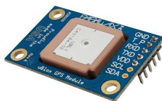
Fig no. 3

GPS module: GPS module, especially NEO -6M model, is an engineer to give highly accurate status data. It is equipped with a UART TTL connector and has a strong active GPS antenna measuring 25 x 25 mm, which appoints advanced technology for optimal performance. To facilitate sharp acquisition of GPS lock, the module contains an underlying battery. This update GPS module is compatible with Arduino Pilot Mega V2 platform, providing accurate status information that significantly enhances the performance of Arduino pilot and other multi control systems.