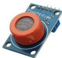
Fig no. 4

MQ3 Sensor: The MQ3 gas sensor is designed to be resistant to gasoline, vapor disturbances and smoke, exclusively demonstrating high sensitivity to alcohol. It produces an analog resistance output that varies according to the concentration of alcohol present in the environment. As the concentration of alcohol gas increases, the conductivity of the sensor increases accordingly. The internal resistance of the sensor changes depending on the detection of alcohol for accurate measurement of alcohol.