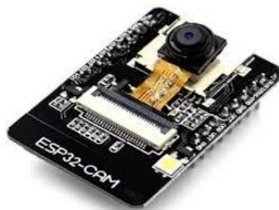
Fig no. 5

Battery power supply: The effectiveness capacity of the battery power supply (measured in ampere-hour, AH), is affected by factors such as voltage and discharge rates. Battery technology continues to increase advance energy efficiency, lose weight and increase the longevity of the battery.