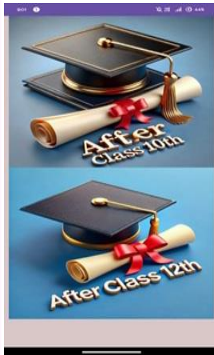
2.After 10 th and 12 th option.