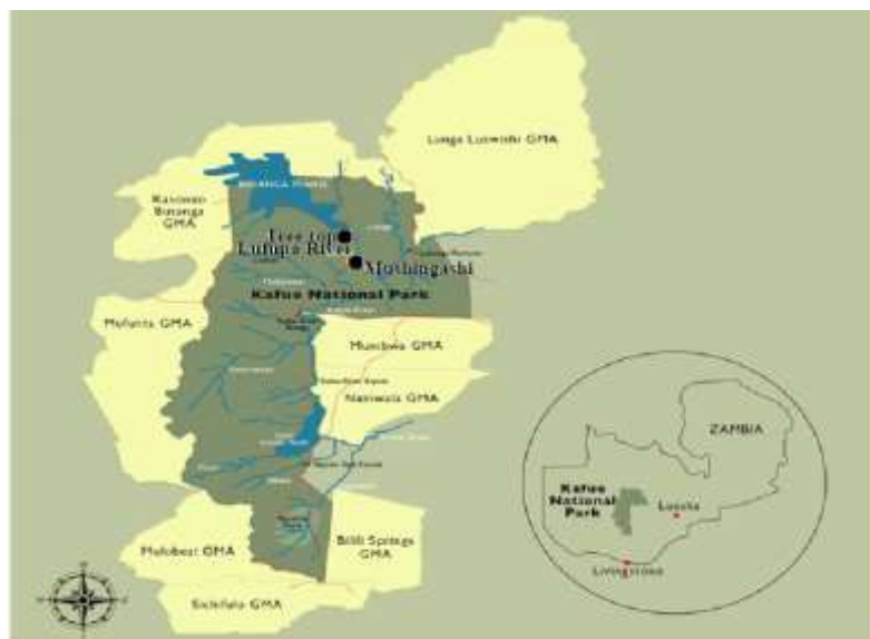
Fig. 1 - Map showing the location of study sites along Lufupa River