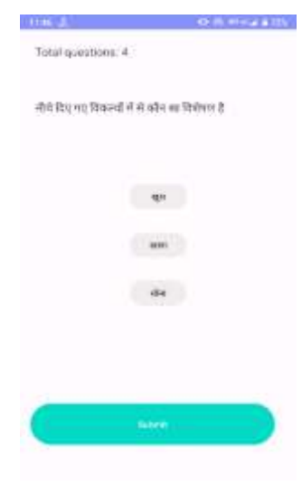
Figure 5. System Screenshot 5