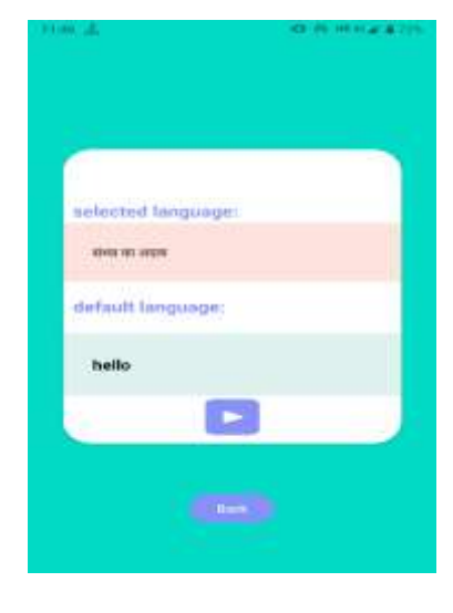
Figure 4. System Screenshot 4