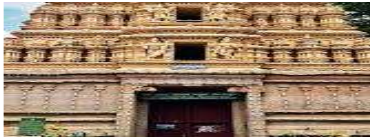
Figure 1: 7 th sense to 14 th sense of brain is present in upper portion of hindu temple

Truly his number has no importance to Islam or Islamic lessons. It is likely a development of overeager Muslim or somebody who needed to pull a trick on Muslims. In Islam there is no gift in objects, names, sacred writings, holy people, numbers, planets, stars, puts and so forth all alone. Favoring is just in doing activities that are referenced to be honest in Quran and customs of the Prophet, harmony arrive, and to avoid sins. Indeed, even Quran itself has no gift except if it is recounted, comprehended or followed up on. Allah, Lord of all the world's, distant from everyone else has ability to benefit or hurt. The rest is only a trickery.