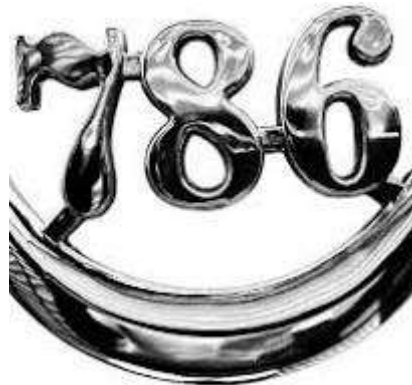
Figure 3: The quran 786 represent the universal energy of god with nicolas tesla code