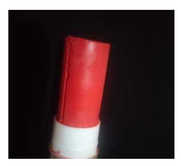
Fig. No.14 Organoleptic Properties