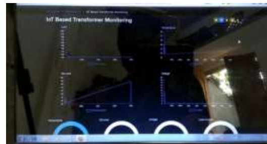
Figure 3: Experimental Results