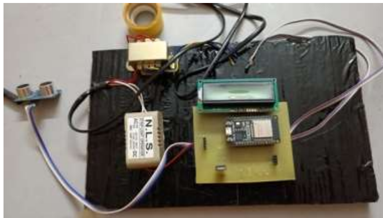
Figure 2: Project Hardware