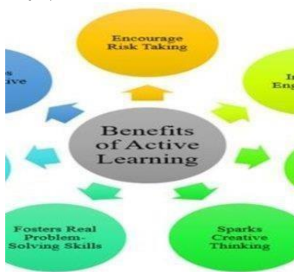
Fig: Benefits Of Active Learning Strategies

The proposed system aims to develop a comprehensive Water Quality Prediction System that leverages advanced machine learning algorithms to enhance the accuracy and efficiency of water quality assessments.