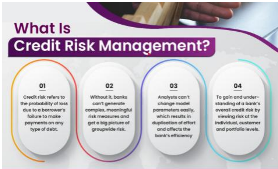
Figure 2 Concept of credit Risk Management [8]

The primary purpose of credit risk management is to ensure that financial institutions maintain the quality and stability of their lending portfolios while maximizing profitability. By using tools such as credit scoring, risk modelling, and ongoing borrower data analysis, institutions can tailor loan conditions (e.g., interest rates, repayment schedules) to reflect the borrower's risk profile (Crouhy et al., 2014). This approach not only minimizes losses but also strengthens the overall financial system by preventing systemic risks that can arise from widespread defaults. In addition, credit risk management helps institutions comply with regulatory frameworks, such as Basel III, which emphasize the need for robust risk mitigation practices to ensure global financial stability (Schuermann, 2014).