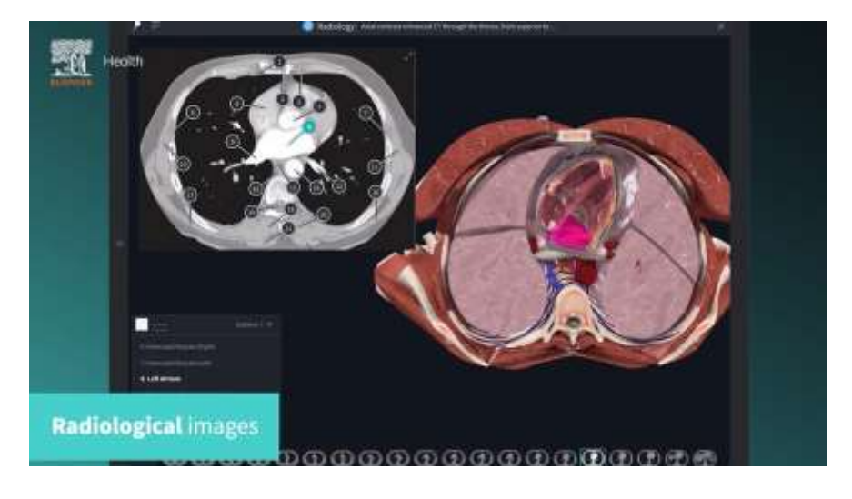
Figure 6. Radiological images.

The company's 3-D body technology also helps students understand spatial relationships in the human body with interactive anatomy labels. Another advantage of this Virtual Anatomy tool is that the technology allows users to customize the look and feel of 3-D anatomy models to highlight anatomical structures or to highlight key function (FIGURES 6 and 7) (BIODIGITAL, 2023).