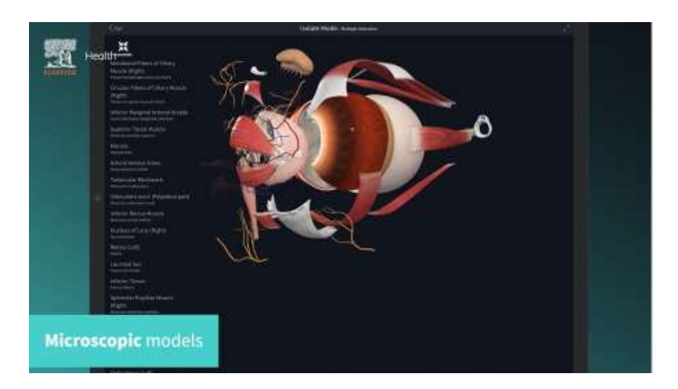
Figure 7. Microscopic models.