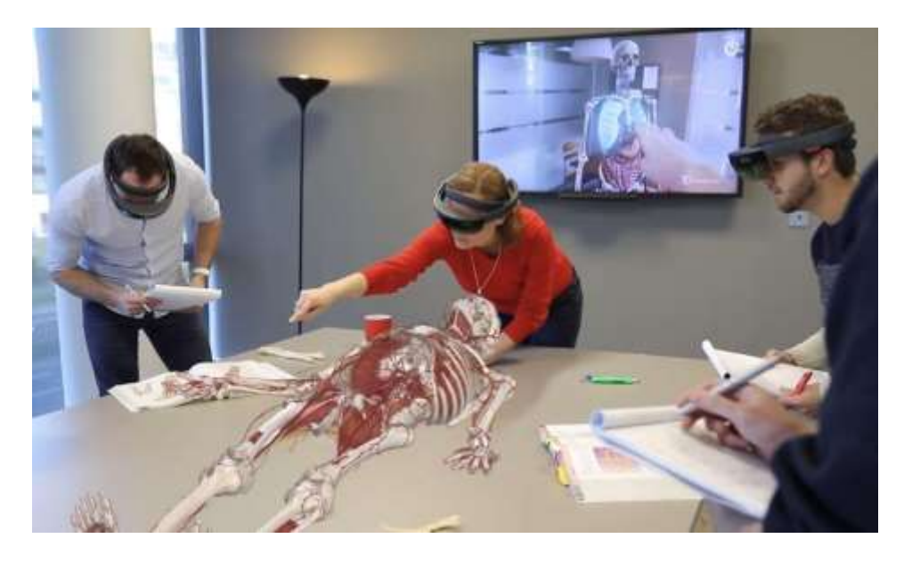
Figure 4. Healthy Simulator Virtual System Technology.

FIGURE 4 shows Healthy Simulator's Virtual System technology.