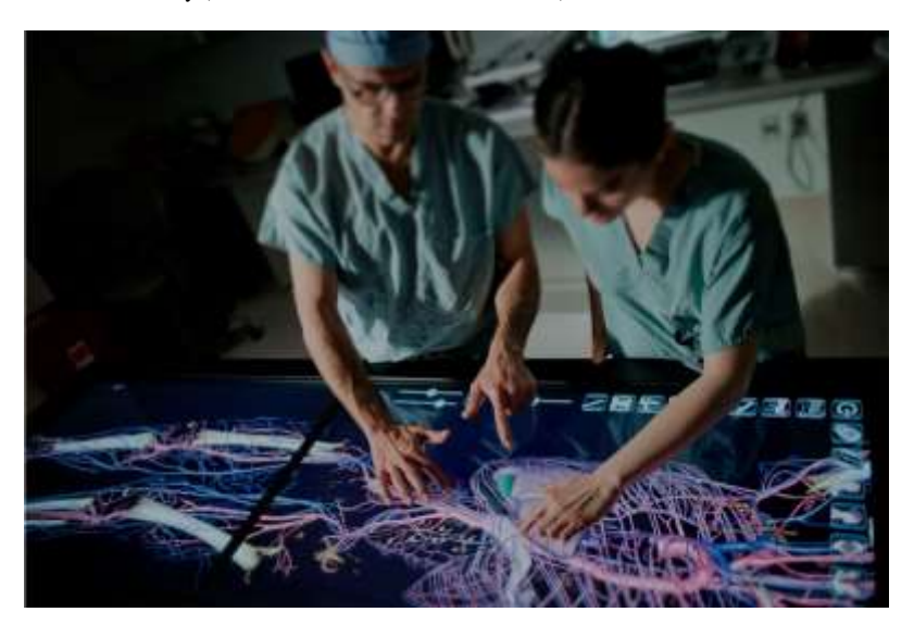
Figure 5. Virtual Dissection Table

Complete Anatomy is a cloud-based 3D animated learning platform from 3D4Medical that allows users to investigate the finest details of human anatomy in 3D. Validated by an academic advisory board and in-house anatomical experts, this is one of the most accurate and complex 3D anatomical atlas platforms available today (MORE THAN SIMULATORS, 2023).