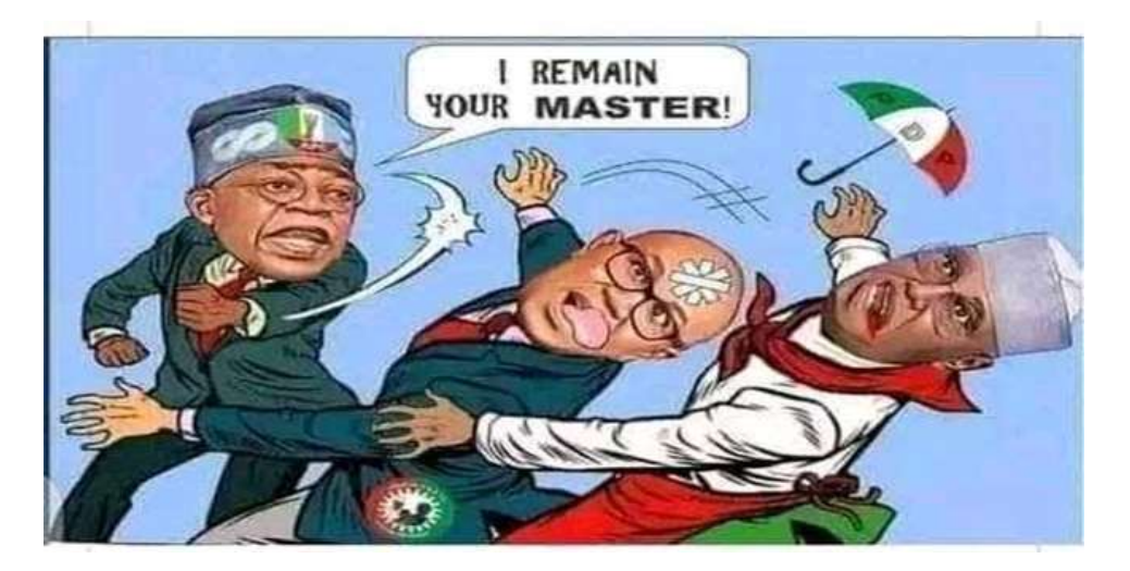
Fig. 4: How the 2023 General Election Successfully Compromise