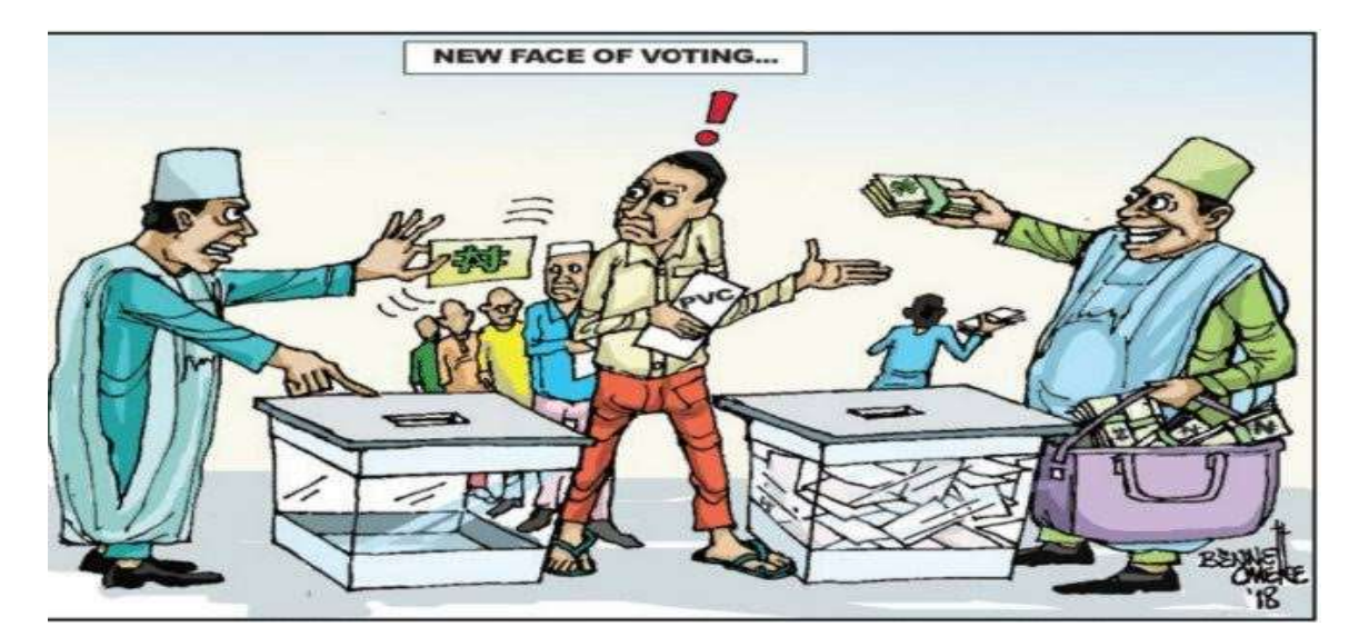
Fig. 2: Cartoon Analysis Showcases Voter Buying

The impact of vote buying is far-reaching, raising election costs, promoting corruption, and undermining the legitimacy and integrity of elections. It can discourage qualified individuals from seeking office and erode public trust in government institutions, fostering a cycle of poor governance.