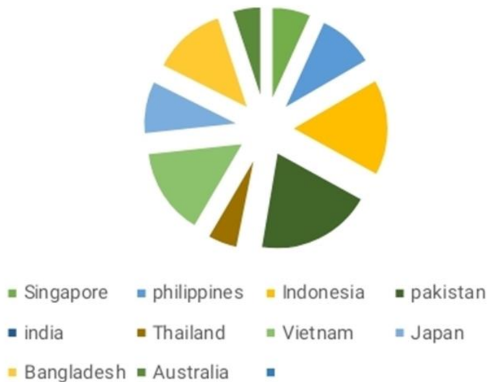
Figure:1&2(Hegemonic competition)