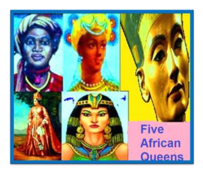
< Fig. The 5 African Queens: Aminatu, Makeda , Nefertiti (top row, left to right), Ranavalona, Cleopatra>