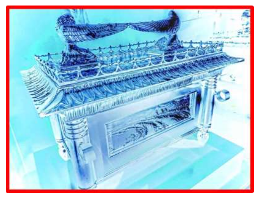
<Ark of the Covenant's Manifest Global Order>