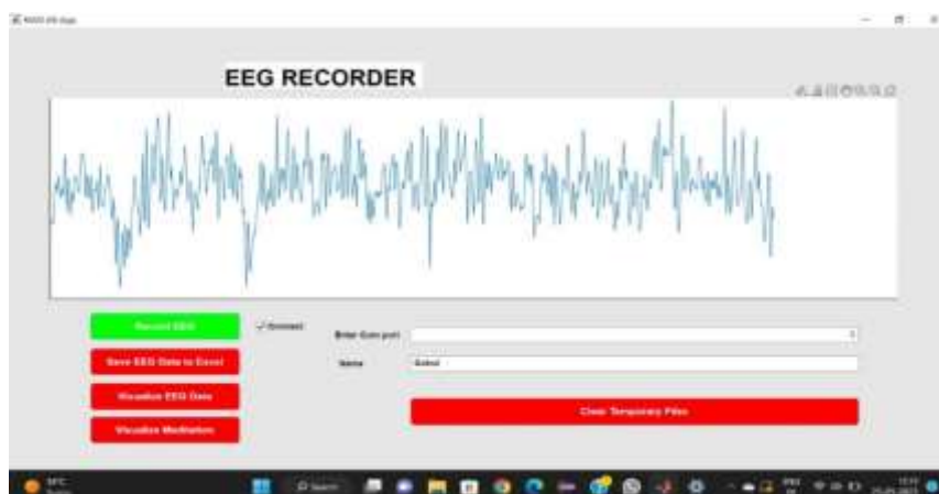
Figure::Raw EEG Waves