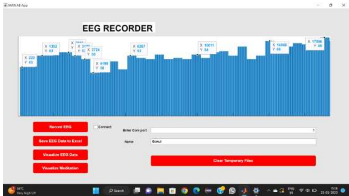
Figure: Meditation Display