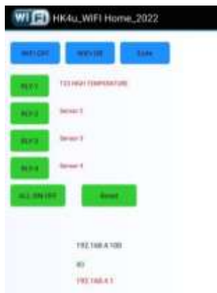
Fig 3. Result collected from the mobile application