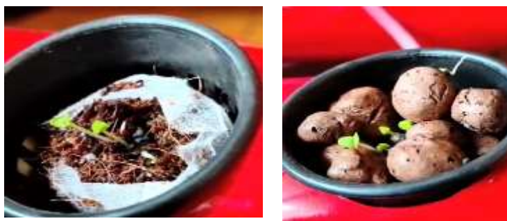
Fig 2. Growth progress of plants