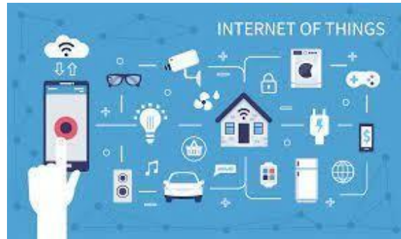
Fig 1.0 INTERNET OF THINGS