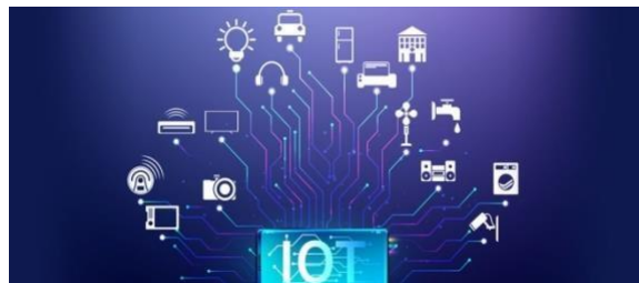
FIG 2.0 IOT