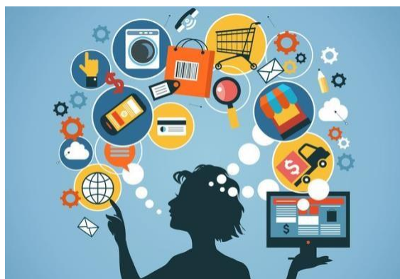
FIG 5.0 IOT WORLD