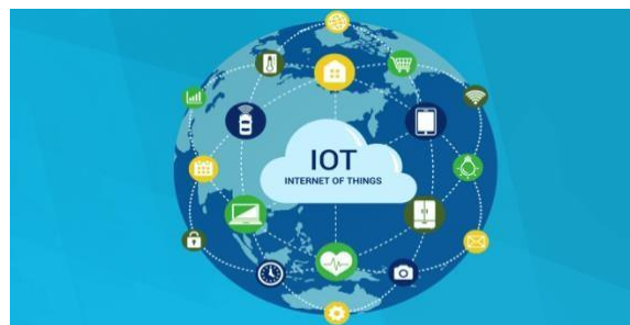
FIG 3.0 IOT ADVANTAGES