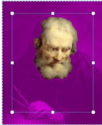
<fig. Archimedes born c. 287 BCE, Syracuse, Sicily [Italy]—died 212/211 BCE, Syracuse>

It was through Archimedes's method of exhaustion that an infinite number of progressive subdivisions could be performed to achieve a finite result (Kline, 1990).