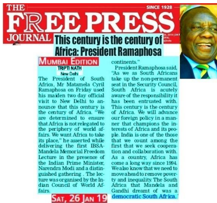
Fig. South African President, Ramaphosa’s claim of 21st century

What the 21st century Africa epitomizes is “the next big thing,” since it has experienced moments of inspiring economic progress . As home to seven of the 10 fastest growing economies in the world, the continent has in the past few years received a slew of attention from investors, commentators, developers and philosophers alike. With an abundant store of virtually every resource in the world (land, oceans, minerals, energy) and a population of over a billion people, the interest in Africa today is its scientific rise and from the economic perspective, Africa is now the second most attractive investment destination in the world . In Africa, the speed of change in almost every discipline of human effort is something to comprehend and in consonance with the hallmark of fame that Africa is the motherland of the human race. That’s how, the traditional, focusing on value systems, social structures, economic activity and democratically affiliated formations of governance systems surface in this ‘Endeavour’. Over the past decade, the growth of the African continent has been, to put it modestly, remarkable. What is more, the advances being made in Africa are not limited solely to economic growth, but have been spread across the board. The current spike in education, standard of living, health, and governance is set to keep increasing over the next 30 years and beyond, certainly making the 21st century Africa’s without any doubt in my mind.