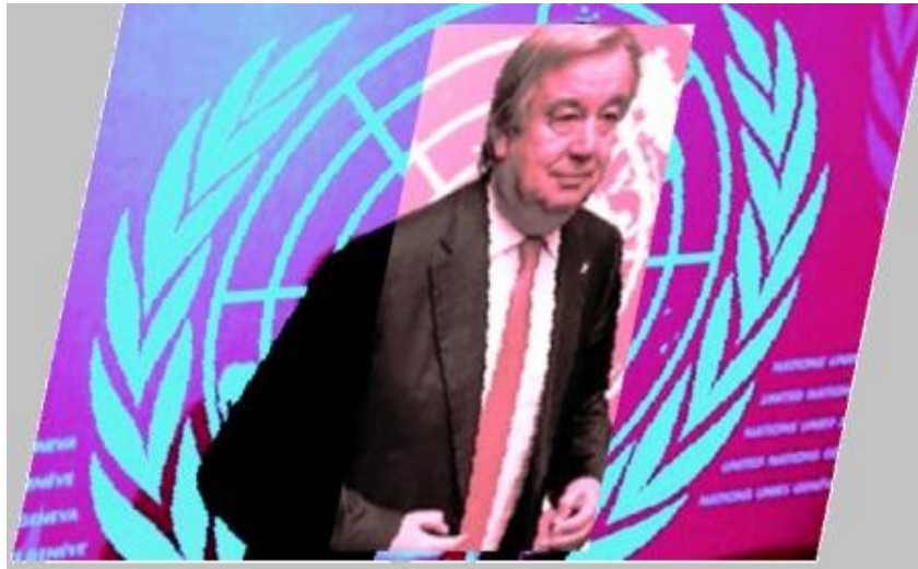
Fig. United Nations General Secretary, Hon'ble António Guterres

Africa and the Dark Side of the Moon in the 21st Century, i.e., the Africa and the China apparently figured to be connected with reference to valued prominence to the claim of the 21st Century. "Technological age", "War on Terror" & "Multiculturalism" are the order of the day while their trend is more uniform across the globe keeping in mind especially both Africa and China, like clapping hands joined together. Both are influential Members at the United Nations (UN) having to do with World's Security and Safety and Economies in addition to their mutual investment-partnership-diplomatic bilateral cooperative arrangements and summits. On 3-9-2018, at Beijing (China), the UN Secretary-General António Guterres, said that "Together, China and Africa can unite their combined potential for