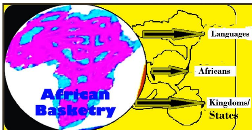
Fig. An African Basketry Perception before & after Africa’s occupation by the Big Powers

An African Basketry of Heterogeneous Variables: Dahomey-Dahalo-Dandi