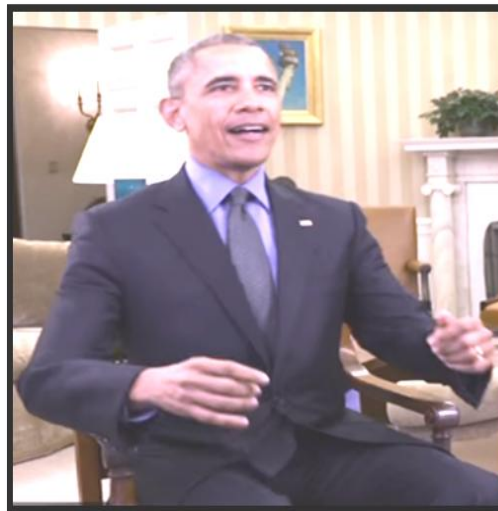
Fig. Afro-American President Obama Farewell, White House