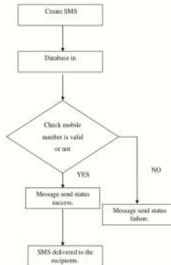
Figure 3: Message Flowchart