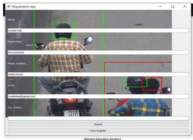
Fig 2: Vehicle Registration

Vehicle Registration: The registration module in our system plays a crucial role in managing and maintaining the database of motorcycle owners, their contact information, and associated vehicle details. The module is built using PyQt, a versatile Python library for creating graphical user interfaces. The PyQt GUI registration module offers a user-friendly interface that allows authorized personnel to input and manage the data related to motorcycle owners and their vehicles. It includes well-structured forms and intuitive controls for efficient data entry. The module provides fields for entering essential owner information, such as name, contact number, email address, and residential address. This information is critical for sending challan fines and notifications. The PyQt GUI-based registration module is a vital component of our system, ensuring the efficient management of owner and vehicle data. It enables accurate and timely challan fine notifications, enhances the overall functionality of the system, and plays a central role in ensuring road safety and regulation enforcement.