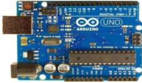
Fig no.3: Arduino uno