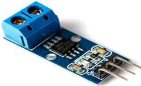
Fig no.4: ACS 712 CURRENT SENSOR

ATTENUATOR CIRCUIT A full-wave rectifier converts the whole of the input waveform to one of constant polarity (positive or negative) at its output. Resistors R1 and R2 form a voltage divider that scales down the AC voltage. 3.3 CURRENT MEASUREMENT For current measurement we are using a CT sensor. The current sensor module is a device that is used for making current measurements. ACS 712 allows measurement of current direct or alternating current flowing in a conductor. The measured current generates a magnetic field which is the sensor converts to a proportional output voltage using the hall effect. The voltage in turn is read by a microcontroller system to an A/D converter to calculate its peak value and the corresponding RMS value of the load current.