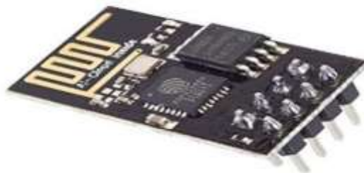
Fig no.5: WI-FI MODULE ESP8266

WI-FI MODULE ESP8266 WI-FI module is a self-contained SOC with integrated TCP/IP stack that can give microcontroller access to the Wi-Fi. ESP8266 module is a cost-effective board with a huge community.