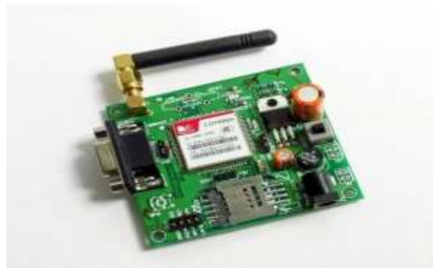
Fig no.2: GSM module

GSM abbreviates global system for mobile communication, this is a second generation (2G) mobile network. This is widely used all over the world for mobile communication. This GSM device consists of a sim slot in which a sim can be inserted which has a unique number, this unique number is used for contact. This GSM device consists of a unique number called imei number and this is different for each and every hardware kit. In our project the device is used for transmitting data. The data from GPS is transmitted to a given mobile through this GSM itself.