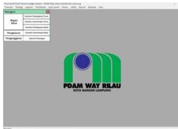
Fig. 1 – Accounting Information System App Municipal Waterworks Way Rilau.

uses the PrismaSoft Multi General Ledger System. This program is a computerized ledger system used by organizations. Data processing is a direct tactic that can be used to transform data into information so that the resulting information is useful and valuable to the individuals who need it. Data processing is done to convert raw data into usable information. This restructuring method is carried out in the context of an accounting information system following several important procedures. The accounting data for Municipal Waterworks Way Rilau was processed using the PrismaSoft Multi General Ledger System program. Every transaction must be registered at the Municipal Waterworks Way Rilau and be fully documented using letters such as checks, notes, and other official letters. In addition, this office has a history of using the interface software provided by the PrismaSoft Multi General Ledger System. How data system development procedures for accounting information systems are carried out directly influences the quality of information produced by accounting information systems. The loan terms are described in the information collected from the accounting information system. An accounting information system is needed when the company's management team or other leaders are appointed as a reference for transaction decisions. High-quality information is required to prepare responses; as a result, high-quality information is required to meet the decision reference requirements.