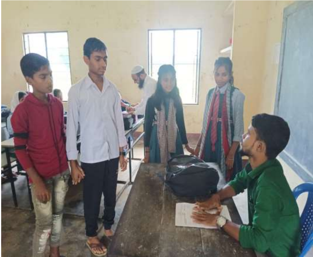
Student Teacher interviewing the students