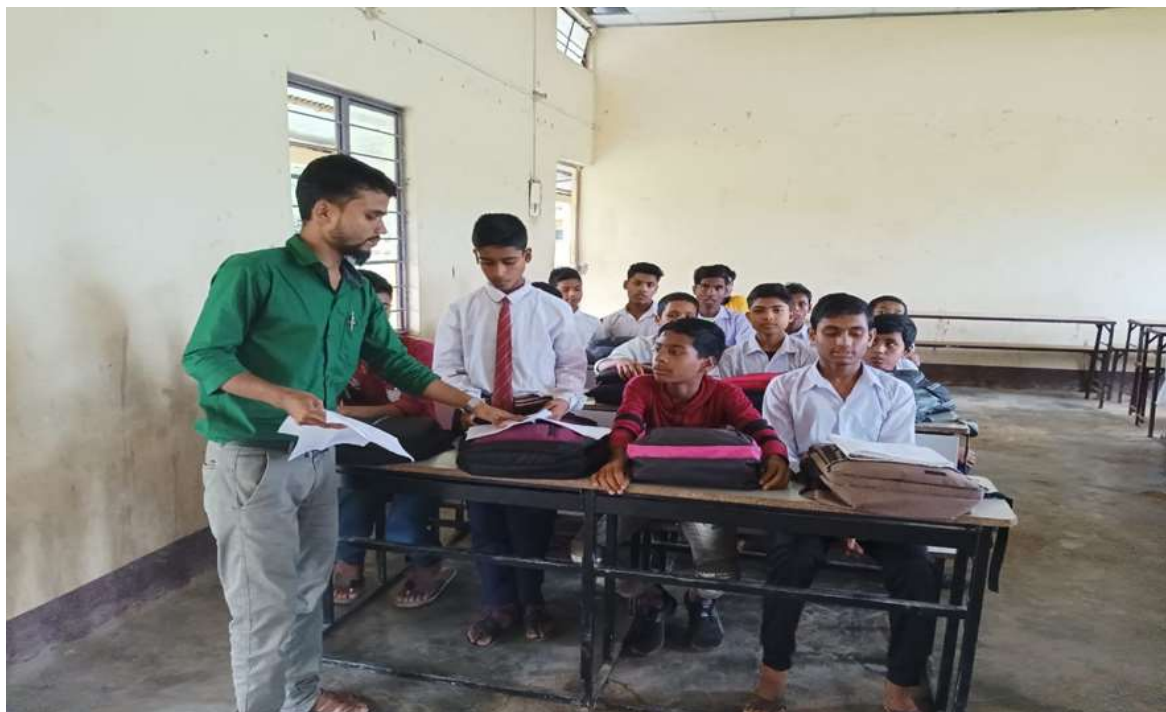
Glimpses of distributing survey questionnaire to the students for taking their opinion