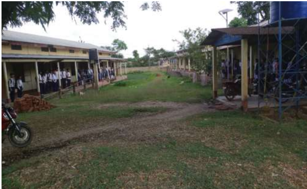
A view of the school campus