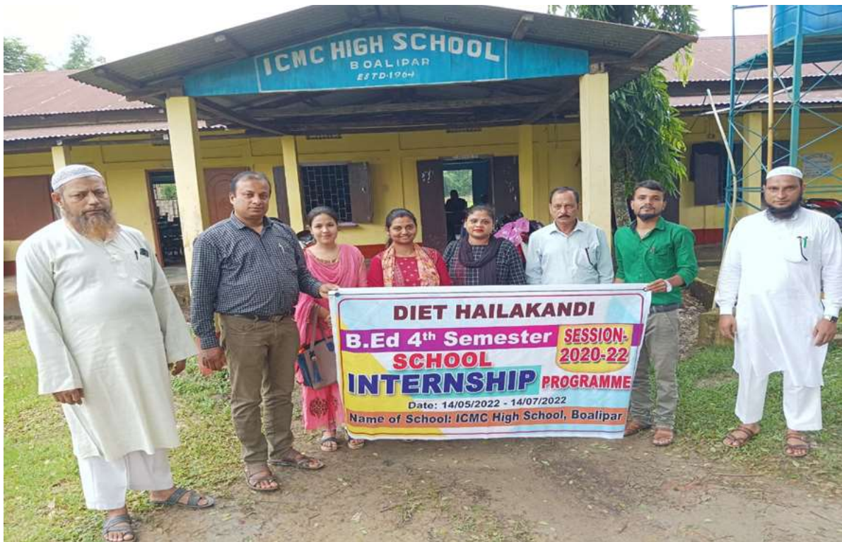
A group photo with Principal and Supervisors