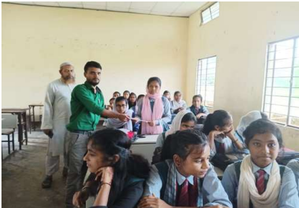
Student Teacher receiving the responses made by the students