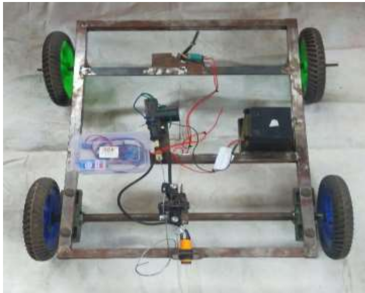
Fig. Intelligent Reverse Braking System

The braking distance is the main factor considered in this system. Braking distance for a particular speed is the distance between the point of application of the brakes and the point at which the vehicle comes to a complete stop from the present speed.