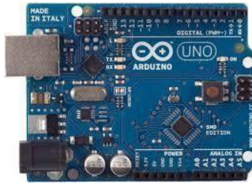
Fig.1 Arduino Uno

program onto the Arduino Uno board from Arduino IDE.. It can too be charged with a battery or an AC-to-DC connector. The Arduino Uno is fueled by a 5 volt supply, but it can handle up to 20 volts • The microcontroller The Arduino Uno's brain, which may be a unmistakably obvious dark rectangular chip on the board with 28 pins, serves as the controller.