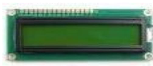
Fig. 3. Liquid Crystal Display for Displaying Readings

Liquid-Crystal Show (LCD), appeared in Fig. 3, may be a level- board show or other electronically tweaked optical gadget that employments the light-modulating properties of liquid crystals combined with polarizers. Fluid crystals don't transmit light specifically, instep employing a backdrop illumination or reflector to create pictures in color or monochrome. LCDs are accessible to show subjective pictures (as in a general-purpose computer show) or settled pictures with moo data substance, which can be shown or covered up, such as preset words, digits, and seven- fragment shows, as in a computerized clock. LCDs can either be