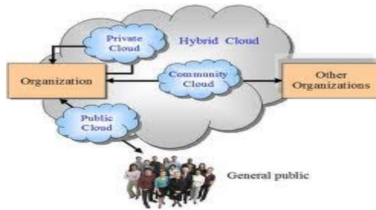
Figure 1: Architecture Diagram of multi tenancy cloud infrastructure

The above diagram illustrates the architecture of cloud infrastructure. There are four cloud deployment models. They are private cloud, public cloud, community cloud, hybrid cloud.