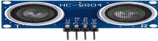
Fig 2.3: Ultrasonic sensor

sends an ultrasonic pulse out at 40kHz which travels through the air and if there is an obstacle or object, it will bounce back to the sensor.