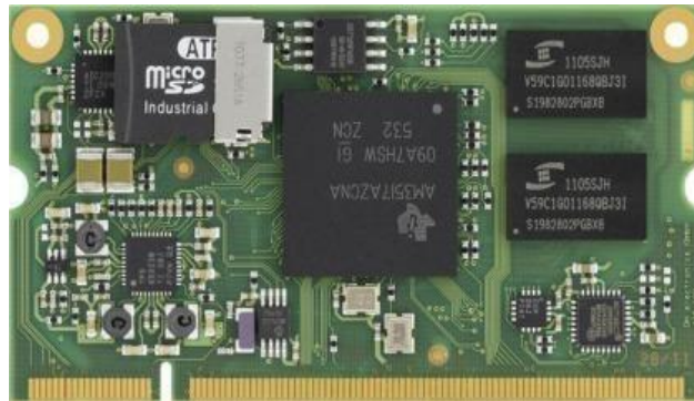
Fig.2.1 Simple Embedded system

The most basic embedded systems are only capable of performing a single function to achieve a single goal. The functionality of embedded systems in more complicated systems is determined by an application program that allows the embedded system to be utilized for a given purpose in a specific application. Because of the capacity to have programs, the same embedded system can be utilized for a variety of tasks.