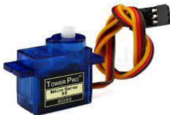
Fig 2.5: Servo motor

A servomotor (or servo motor) is a simple electric motor, controlled with the help of servomechanism. If the motor as a controlled device, associated with servomechanism is a DC motor, then it is commonly known as a DC Servo Motor. If AC operates the controlled motor, it is known as an AC Servo Motor. A servomotor is a linear actuator or rotary actuator that allows for precise control of linear or angular position, acceleration, and velocity. It consists of a motor coupled to a sensor for position feedback.