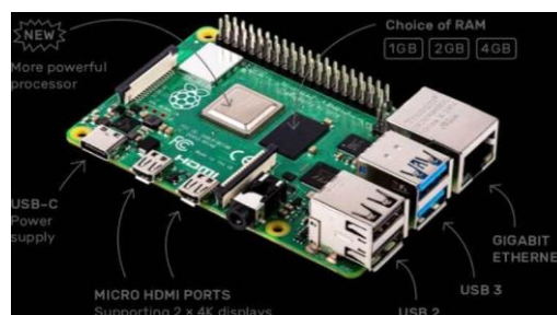
Figure1.1: Raspberry Pi 4b

That being said, a web browser is still a necessary feature for providing and displaying information, as it has built-in support for multiple media formats, such as text, images, and videos. The information presentation can be made interactive with JavaScript and is customizable with CSS (Cascading Style Sheets). Furthermore, hyperlinking and web connectivity allows for borrowing and sharing of resources.