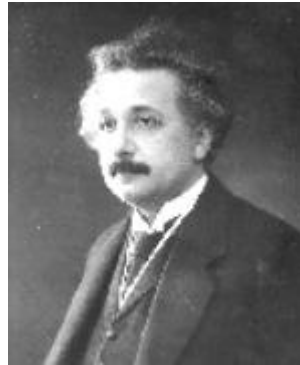
German Scientist Albert Einstein

Quoting the German physicist Albert Einstein's context, who came up with the theory of relativity it was his description of the photoelectric effect of the White Light that won him the Nobel Prize for Physics in 1921. Albert Einstein lived longer from 1879 to 1955 vis-a-vis Alfred Wegener's short-lived span of 1880 to 1930.