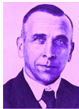
German Professor Alfred Wegener

In the early 20th century, Alfred Wegener published a paper explaining his theory that continental landmasses "drift" across the globe, sometimes through oceans and crashing into each other. He called this movement continental drift. This is the first complete statement of the old continental drift hypothesis. In 1912, Alfred Wegener realized the same, that the continents once called Pangaea (meaning "all