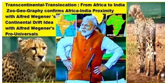
fig. (Centre) Indian PM, His Excellency NarendraModi; (L to R): African Cheetahs airlifted to India arriving on 17-9-2022 (coinciding with Modiji’s Birth Day) as a matter of transcontinental-translocation of pro-Universals confirming Alfred Wegener’s theory of Continental Drift in pre-historical times.

for the Readers of this Paper, it is also mention-worthy that the name “cheetah” originates from Sanskrit, the mother of all languages (Lingua Franca) and means “the spotted one”.