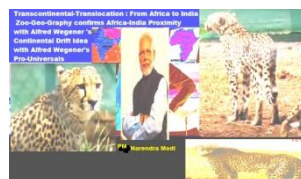
fig. As per Section 6 above

The cheetah is one of the oldest of the big cat species, with ancestors that can be traced back more than five million years to the Miocene