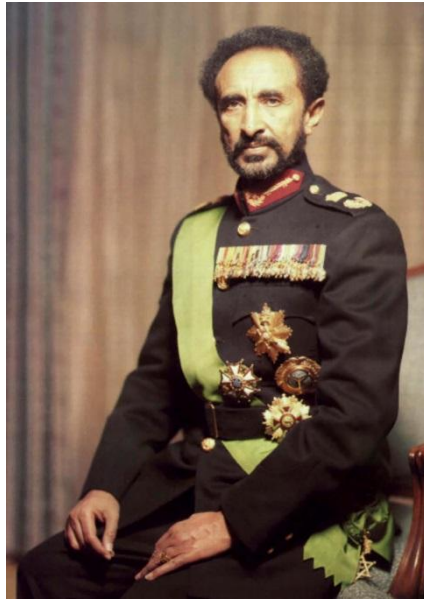
fig. (1963) HAILE SELASSIE, Emperor of Ethiopia

3.The connection between the Vedas and Africa dates back to the Ramayan period. In ancient Vedic lore (the Ramayan connection), Africa was known as Kush, Kushadeep, or Kushadvipa. Two reasons for this were that the vast land was covered with tall grasses known as kusha grass (in Sanskrit) and after the war between Rama (god incarnated as a human) and Ravana (King of Lakshus) , it eventually came under the command and control of Kush or Kushha, the eldest son of the victor Rama. So Africans are Kushites. African government textbooks describe Africans as Kushites, which attests to the above information. In addition, the Abyssinian monarch Haile Selassie (pictured below) declared the Africans to be Kushites. Africa was also known as Shankadvipa in ancient times. The Sanskrit word dvipa means an island and Shanka or Shank is Sanskrit for shell. So, the broad in the middle and narrowing-tailed looking island similar in its outline to the shape of a conch shell.