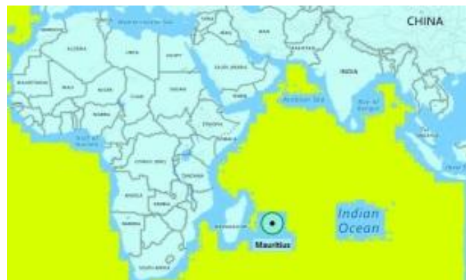
Fig. Africa with Mauritius

4. Another strong Ramayana connection with Africa can be discerned on the island of Mauritius off the east coast of South Africa. The island got its name from "Marichas" which means the island of Marichi who was one of the generals in the army of the demon Ravana and also a name for the sun. However, during the war with Ravana, Rama drove all the demons out of the area and forced Marichi to flee to the demon fort.