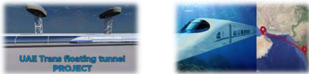
Figure 4: Proposed route between Mumbai and Dubai, UAE

Before the construction the SFTs risk assessment needed to be carried in order to reduce more risks. All the countries in the world are now looking for this type of constructions and by the first Norway and China proposed for the construction of these SFTs. In the year 2020 UAE announced the floating underwater train connecting from Dubai to Mumbai by Abdulla Alshehhi. For this they may construct the route by using the SFTs methodology. Here this covers nearly 2000 km and the major idea for the construction of SFTs is for the goods exchange and the tourism. For the construction of the SFTs many challenges need to be overcome so as to sustain all the challenges and the perfect completion of the constructions. The proposed route between Mumbai and Dubai for SFT is shown in Figure 4.