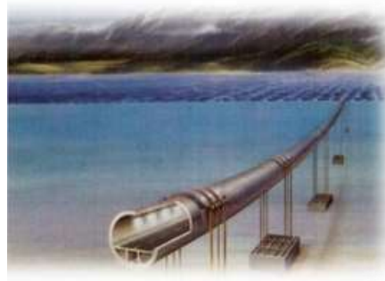
Figure3: SFTs with tethers

The first SFT was constructed in Norway. The project had used tethers for supporting the tunneling system. The points that were in favor and disfavor of tethers are listed below.