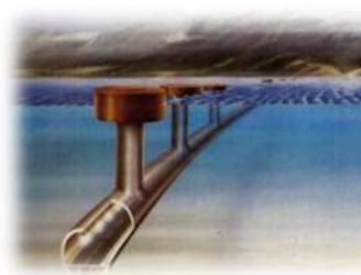
Figure2: SFTs with pontoons

Vertical tethers (Figure 3) down to the sea bottom will also give vertical stiffness, but virtually no horizontal stiffness. In order to also get horizontal stiffness the tethers have to be inclined. Then, the tethers should be neutrally buoyant in order to avoid reduced stiffness due to geometry deviating significantly from straight lines.