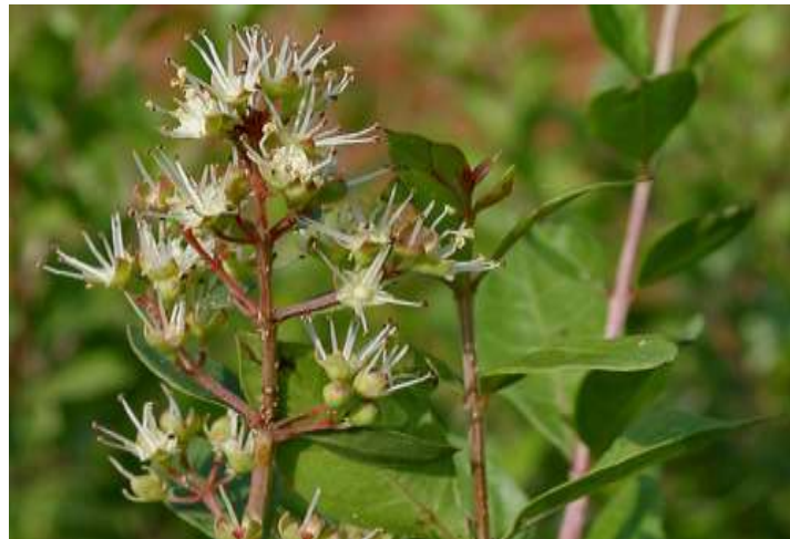
Fig: 9. Henna