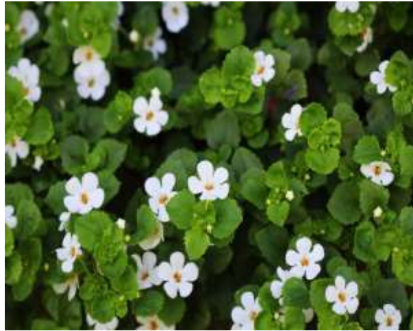
Fig: 8. Brahmi