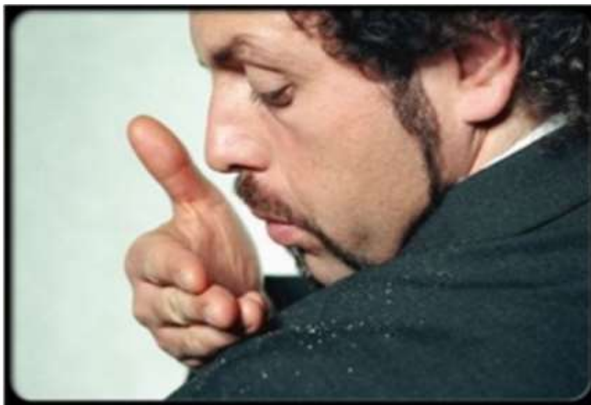
Fig. 2 Dandruff

This particular type of hair loss is brought on by the adverse consequences of cancer treatment. [1] As much as 50% of the world's population experiences dandruff at some point in their lives, making it one of the most frequent complaints. The ailment is typically identified by flakes on the scalp and in the hair. The degree of the scaling can range from minor to severe, and the symptoms can be different. In young men and children, both its prevalence and severity are highest. Older people have dry scalp and dandruff less frequently. 521 (65.1%) of the 800 males have dandruff, compared to 279 (34.9%), and those in the age range of 21 to 40 have the worst dandruff problems overall. [8]