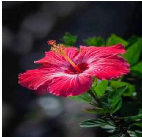
Fig: 10. Hibiscus.