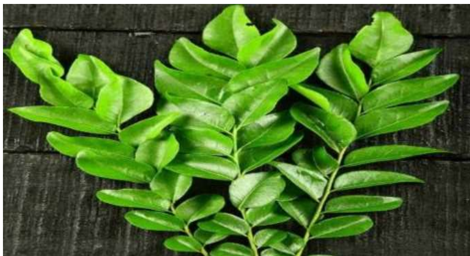
Fig: 4. Curry leaves