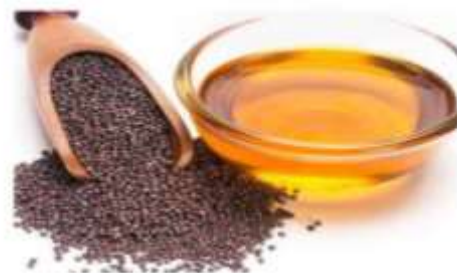
Fig: 11. Mustard oil