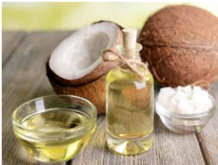
Fig: 5. Coconut oi