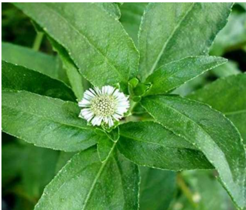
Fig: 7. Bhringraj