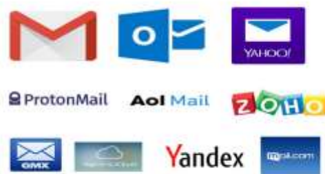
Fig1.1: Email service providers

https://www.google.com/amp/s/www.onmanorama.com/lifestyle/news/2020/05/17/dos-donts-during-videoconferencing-know-your-etiquette.html