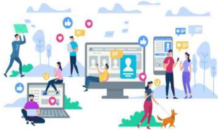
Fig1.3: Social networking