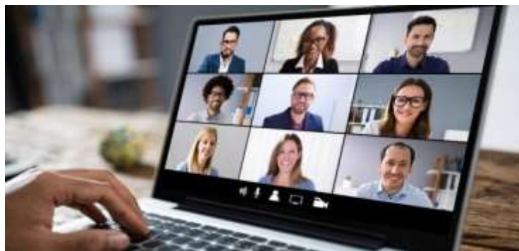
Fig1.2: Video conferencing

https://www.google.com/amp/s/www.onmanorama.com/lifestyle/news/2020/05/17/dos-donts-during-videoconferencing-know-your-etiquette.html