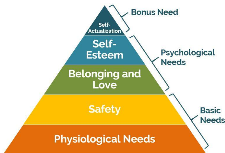
Figure 2. Maslow's hierarchy of needs

The following two factors discussed in this survey are The safety of the destination and People's awareness in epidemic prevention. These factors achieve relatively low total scores, 57 and 63 respectively, with average levels of only 0.13 and 0.15. In the context that the whole world has to bear the heavy effects of COVID-19 in many fields, the above figures reflect more or less the limitations of the organization of social life in general and awareness of sustainable development in tourism in particular. People and potential tourists will inevitably be willing to postpone their trips or not return to this tourist city when their safety needs are not met. This becomes apparent according to Maslow's hierarchy of needs, travel. According to Simková and Holzner (2014), each tourist destination must satisfy two basic needs, namely physiological needs and safety for tourists, before considering other needs in tourism at a higher level, for example, social needs - such as being part of a particular group, cognitive and aesthetic needs, etc.