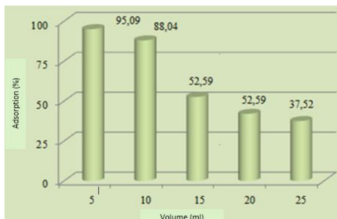
Figure 2. Graph of Fe Metal Absorption Percentage