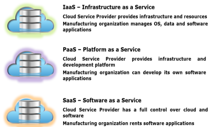
Fig Cloud Service Models

There are four primary cloud computing deployment models which are available to service consumer. Each deployment model is defined according to where infrastructure of environment located.