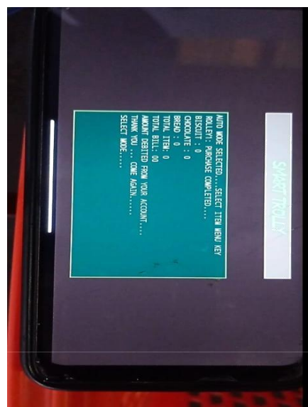
Fig 3 : Bluetooth Electronics App

RFID Reader is connected to shopping streetcar or shopping container which identifies the presence of the normal client and with this, shopping streetcar will go about as a Smart Trolley.. The regular customer requires downloading a mobile application and then the smartphone act as a Bar code scanner.