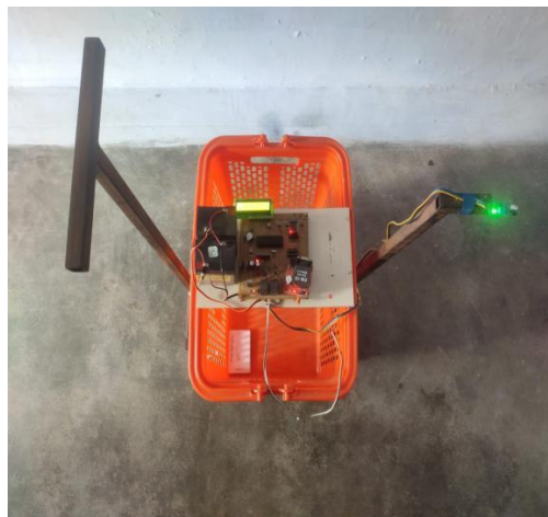
Fig 2 : Project model

This framework gives on spot examining of the item and shows its value subtleties on LCD. This permits clients to contrast the complete cost and the spending plan in the pocket prior to charging. Guide the way for the corresponding product Auto billing system through RF . Hence it prevent the stand in line for the billing purpose to the customer Two mode of operations are possible auto and semi-auto .