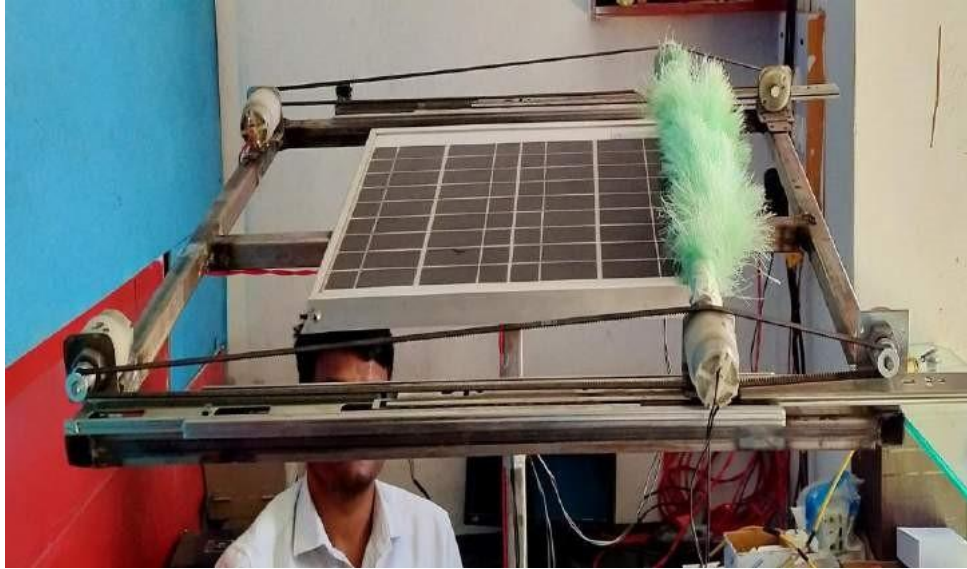
Fig.2 Design of panel cleaning system

This system works at a particular time. This time is set for the operation of cleaning system. The real time is taken from GSM module, at this time relay circuit is operated and motor starts running. Here, Two motors are connected for the movement of brush motors and other two motors are used for rotation of motor. The brush motors are placed on linear actuator mechanism which can slide over left to right or right to left using rubber belt. To detect the actual position of brush limit switch is used. By using this switch movement of brush can be changed for this motors are used for the movement of linear actuator. Linear actuator can moves left to right or right to left by changing the direction of motor clockwise and anti-clockwise.