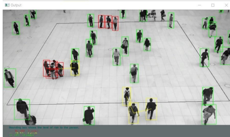
Figure 3 – Detecting People in the frame and calculating inter-people distance