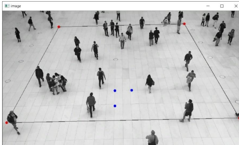
Figure 2 – Selecting Region of Interest (ROI) and distance scale.