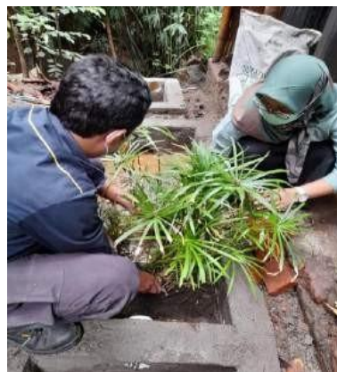
Fig. 4 – Planting Papyrus water as the main medium for wetland filtering

First, the main medium of papyrus was planted (Fig. 4). After the media has been made, a waiting period is carried out to get the papyrus plants accustomed to adapting to new environmental conditions. At this stage, 14 days (2 weeks) are given before the filtration test process is carried out on the media. The method used during the test is to drain waste water from soybean processing into the wetlands, hold it for 1 hour before then flow it back.