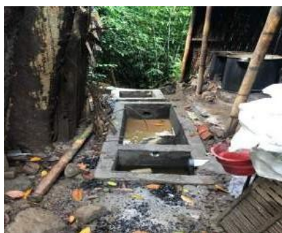
Fig. 2 – Wetland design

After analyzing the results of laboratory tests and direct tests, a mini model of wetlands was designed in the research location which functions as a waste water treatment plant from the soybean processing industry. This design is a development of various literature studies that have been carried out, including