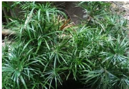
Fig. 3 – Papyrus water as the main medium for wetland filtering

The design that has been made is immediately applied by constructing a supporting building for the mini media facility for wetlands (wetlands) which functions as a facility for wastewater treatment plants in industrial sites. The supporting building is in the form of a small tub made of masonry as a raw material and cast the floor with the size and volume according to the design drawing. In the supporting building, it is filled with filtration media in the form of soil, sand, and papyrus water plants as the main media for wetland filtering (Fig. 3).