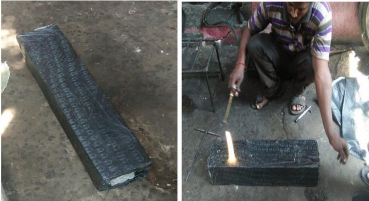
Fig. 2 - Showing fully wrapped beam under testing