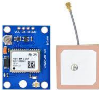
Fig. 2 - Global Positioning System

Global Positioning System is responsible for fetching real-time GPS coordinates of the bike. There are 24 GPS satellites revolving around the Earth. GPS module uses these satellites to calculate latitude and longitude, and as well as the altitude of the vehicle. The GPS receiver gets a signal from each GPS satellite. The satellites transmit the exact time the signals are sent. By subtracting the time the signal was transmitted from the time it was received, the GPS can tell how far it is from each satellite. The GPS receiver also knows the exact position in the sky of the satellites, at the moment they sent their signals. So given the travel time of the GPS signals from three satellites and their exact position in the sky, the GPS receiver can determine your position in three dimensions – east, north and altitude.