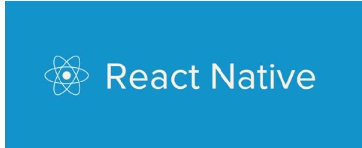
Fig.5 - React Native

Thingspeak server is used for storing data received from the vehicle. GSM module is used for connection between the vehicle and the database. ThingsSpeak is an IoT analytics platform service that allows you to aggregate, visualize, and analyze live data streams in the cloud. You can send data to ThingsSpeak from your devices, create instant visualization of live data, and send alerts.