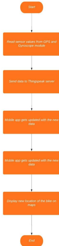
Fig. 1 Flowchart