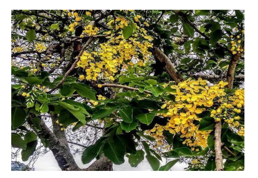
Figure 1 - Pterocarpus marsupium

Malayalam – Venga. Orissi – Piashala. Punjabi – chandan lal. Tamil – Vengai. Urdu – Bijasar [6].