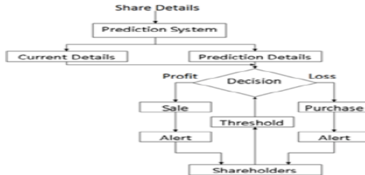
Fig. 1 - Flow Chart For Stock Market

may take like min value, max value, volume, benefit rate, pay, share the cost, and so forth, The fundamental values will be taken from that to predict the analysis[4].