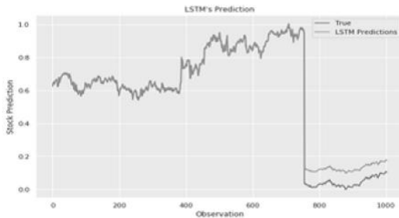
Fig. 2 - LSTM Prediction model

This paper's neural network model was utilized and Long Short Term Memory (LSTM) which is a kind of Sequential and ANN[5]. A Sequential is likewise a kind of neural network model with many types of a straightforward neural network structure, and it has continued in circles that can move between various states state at the season of making neural network structure exceptionally simple