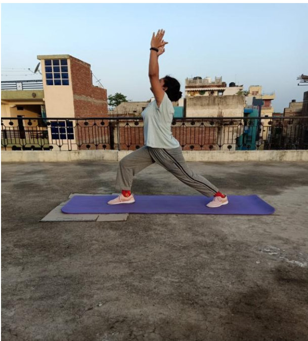
Fig. 1 Virabhadrasana -1

Effective use of various Asanas , combination of Ayurveda medicines and lifestyle management in addition to breathing techniques and meditation have worked wonders on patients suffering from joint pain for people suffering from some serious conditions. The beneficial combination provided for patients subjected to alternative modes of rehabilitation has also emerged as an effective therapeutic option for people suffering from mental stress and anxiety. In modern life, sitting on a piece of furniture is a state of the body in which a person spends most of his waking time, which can result in various diseases like backache etc. Asanas such as Paschimottanasana , Kurmasana etc., can be helpful in the resolution of these diseases; Sitting postures showing the importance of posture.