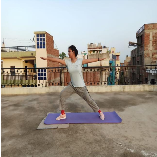
Fig. 3 Virabhadrasana -2