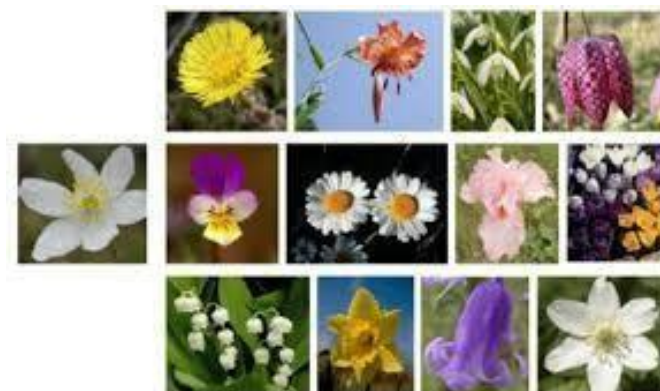
Fig 2: Sample Images from database

Neurons in a fully connected layer have connections to all activations in the previous layer, as seen in regular neural networks. Their activations can hence be computed with a matrix multiplication followed by a bias offset.