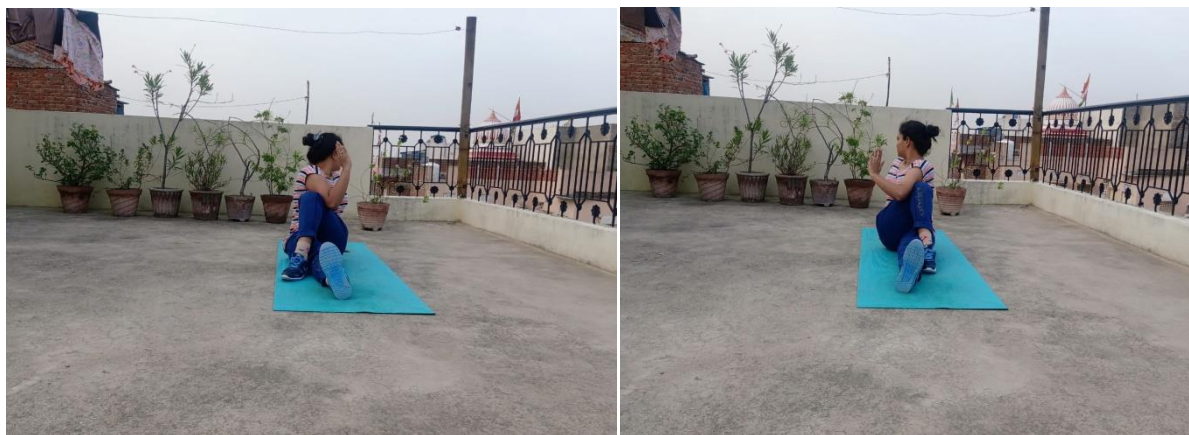
Fig.4, 5 Ardha Matsyendrasana (front view)