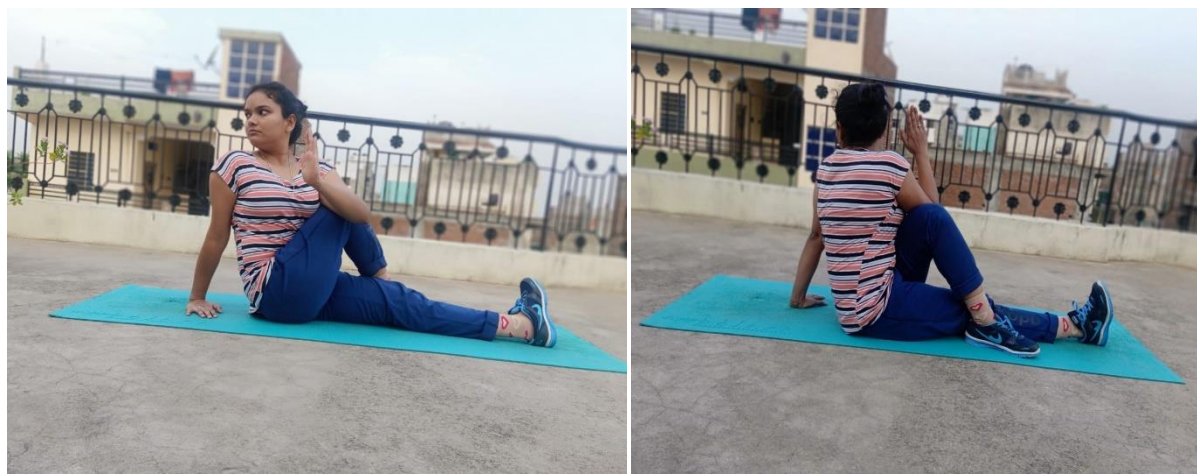
Fig. 2, 3 Ardha Matsyendrasana (side view)