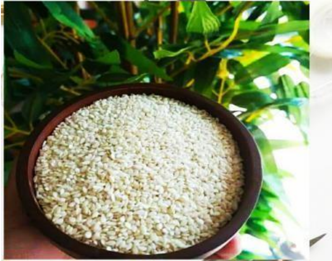
Figure 1 : White sesame seeds