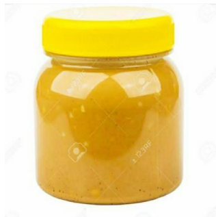
Figure 14: Prepared product

Bottles are then sealed, placed in cartons and allowed to set at 20°C for 35-40 hrs before distribution