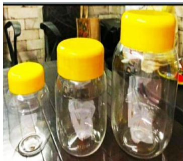
Figure 12: Packaging glass bottles

After grinding, the prepared nut spread is put into a final containers, it is allowed to remain undisturbed until it is completely crystallized [13].