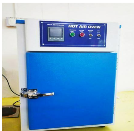
Figure 5: Hot air oven