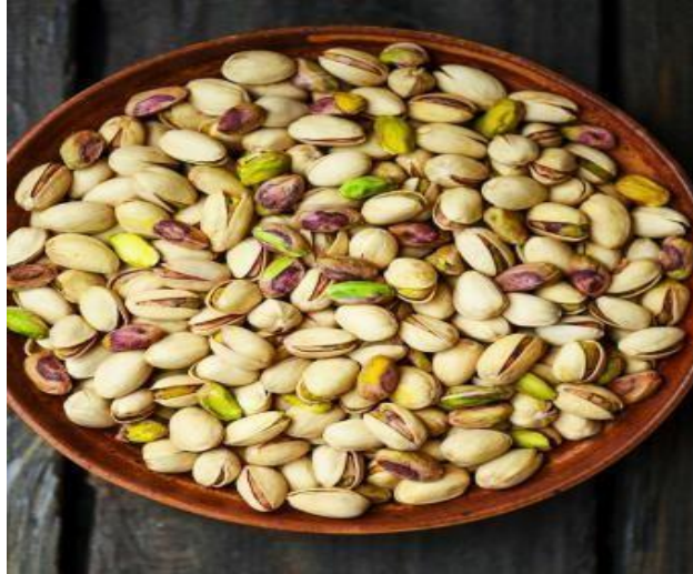
Figure 3: Pistachio