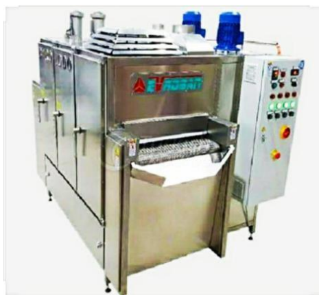
Figure 6: Nut roasting equipment

Raw nuts contains lipoxigenase, which accelerate the oxidation of damaged nuts. The lipoxigenase is usually destroyed during nut roasting, but after roasting, non-enzymatic catalysts can initiate oxidation. During this method, moisture content of nuts were reduced, browning reactions and caramelization occurs and brown pigments are formed.