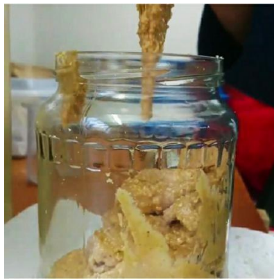
Figure 11: Grinded nut spread

Hydrogenated vegetable oil acts as a stabilizer, which prevents the oil from collecting at the top of the jar [12]. Throughout the grinding process, peanuts are kept under constant pressure to prevent formulation of air bubbles, which could cause oxidation.