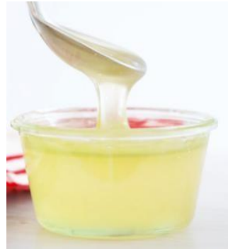
Figure 9: Corn syrup