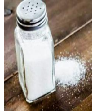
Figure 10: Salt

Hydrogenated vegetable oil acts as a stabilizer, which prevents the oil from collecting at the top of the jar [12]. Throughout the grinding process, peanuts are kept under constant pressure to prevent formulation of air bubbles, which could cause oxidation.