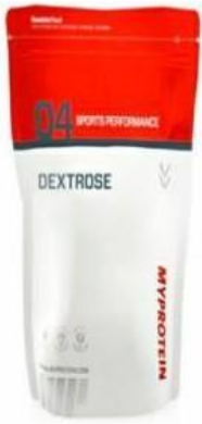
Figure 7: Dextrose.