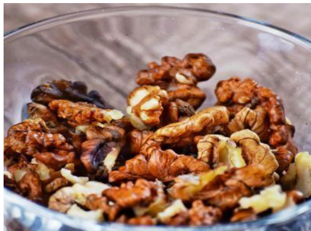
Figure 2 : Walnuts