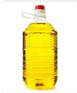
Figure 8: Hydrogenated vegetable oil