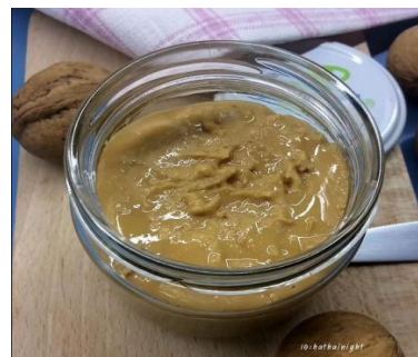
Figure 13: Prepared nut spread