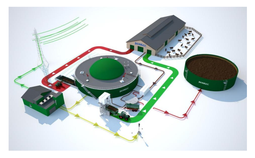
Fig. 1 A realistic flow of Process of Biogas Plant [1] [3]

So here the production of the biogas is the best thing which can be replaced the fossil fuel use and as well as can treat the waste water and sludge type things. So by the use of biogas our environmental will be green and now we don't need to save or store the sludge or wastewater now we can utilize this thin. There is one major use of biogas as well and that is we can use the biogas as an LPG in our kitchen so it will also helpful in our daily life. It can be categorized in a large area or in a small area according to the budget or need.[6][11]