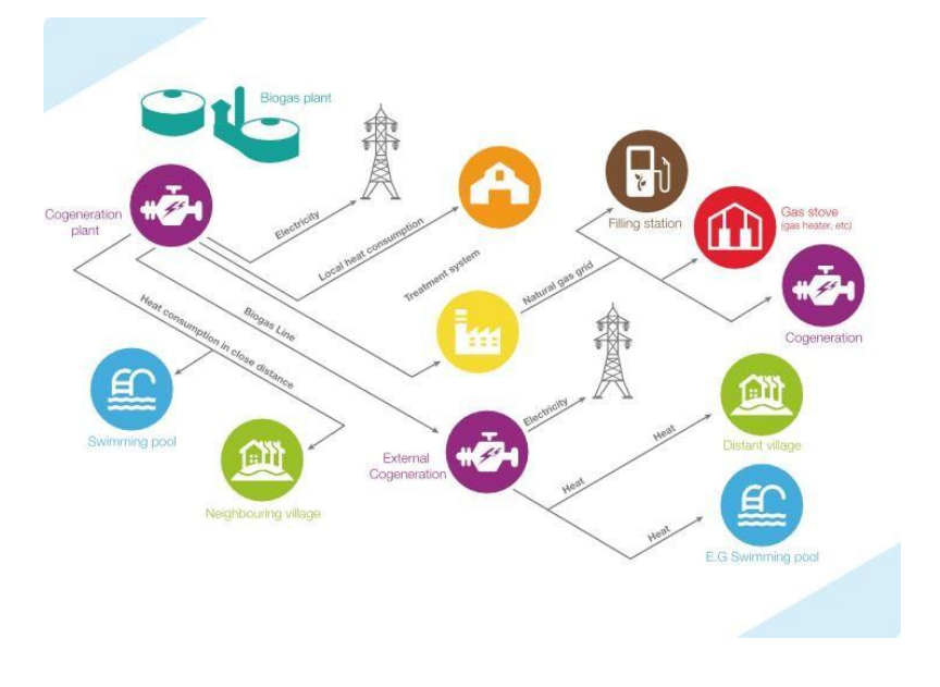
Fig. 4 Different Applications of Biogas[1][3][8]